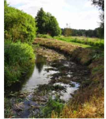
Narrowing of channel