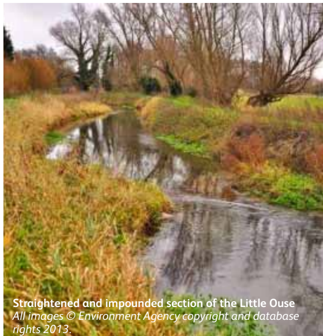
Straightened and impounded section of the Little Ouse