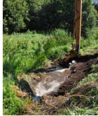
Cutting of two-stage channel