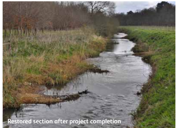
Restored section after project completion